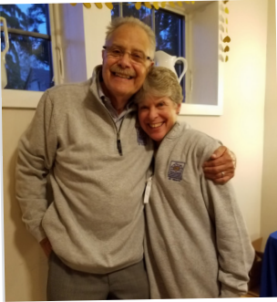
Major Donor Picnic