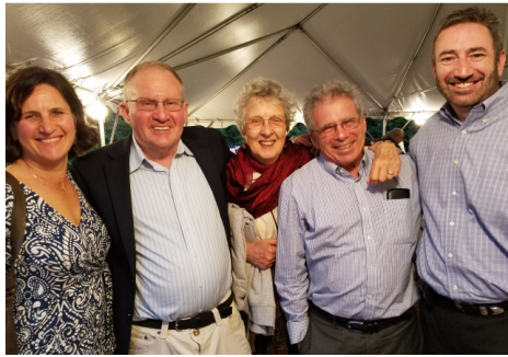
Major Donor Picnic