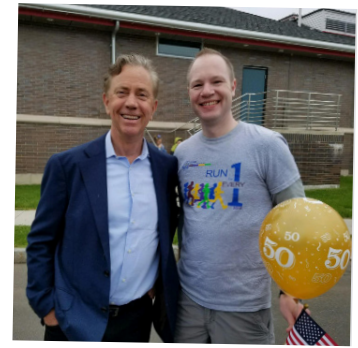
Memorial Day Parade