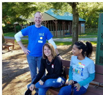
Staff Appreciation Picnic