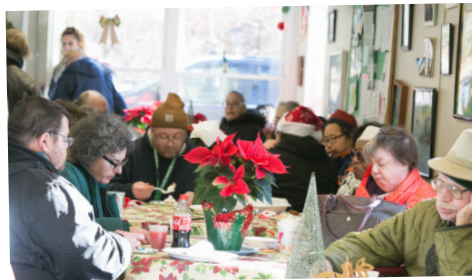
Holiday Party at Social Club