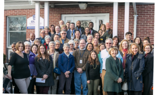
50th Anniversary Kick-Off