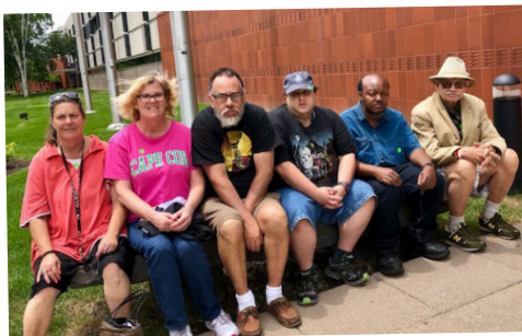
Mashantucket Pequot Museum Field Trip