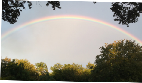
Harkness Park Camping Trip