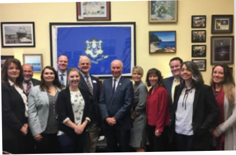
Gilead spends Hill Day at the U.S. Capitol