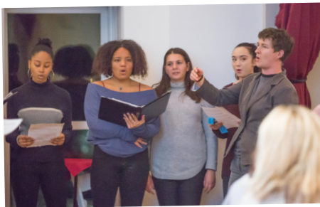
Quizine for a Cause