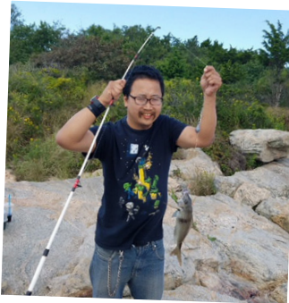
Harkness Park Camping Trip