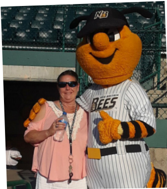
Field Trip to the New Britain Bees Game