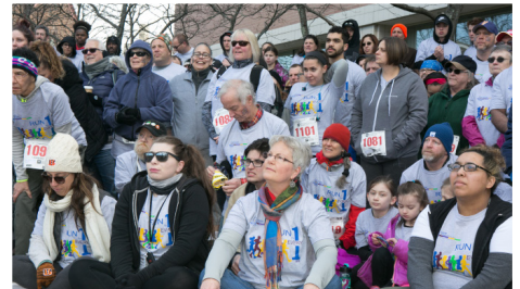
Run for Every 1 2018