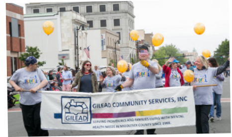
Memorial Day Parade