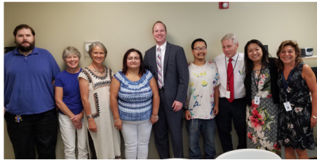
Sen. Suzio Visits Gilead