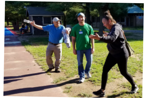
Staff Appreciation Picnic