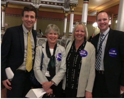
LOB Day at the State Capitol