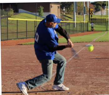
Gilead Gladiators vs. Staff Annual Softball Game