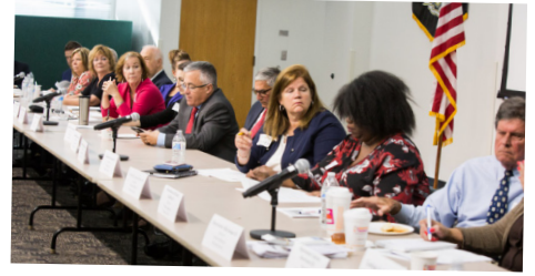
Nonprofit Candidate Forum