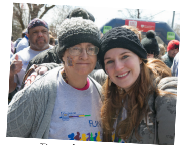
Run for Every 1 2018