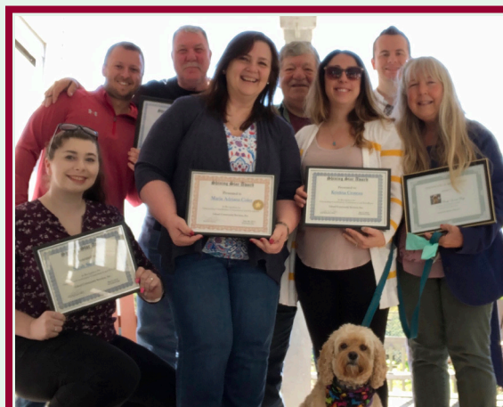
THE SHINING STARS FROM GATEWAY

On behalf of the entire agency, Gilead would like to say Thank You and Congratulations for your passion, commitment and dedication. Keep up the great work!