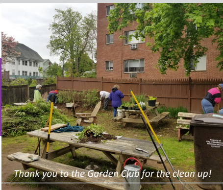
Thank you to the Garden Club for the clean up!