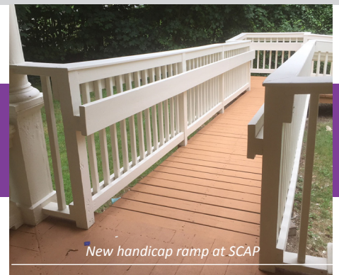
New handicap ramp at SCAP