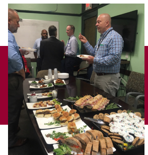
Guests enjoyed delicious homemade hors d'oeuvres by Farrell's own kitchen