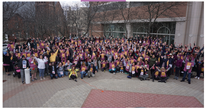
The annual Run for Every 1 group photo!