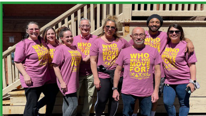
Staff at Farrell Treatment Center wear their matching "Who Will You Move For?" t-shirts for the virtual Run for Every 1 event.