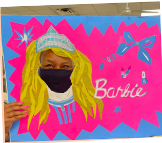
Camp Harkness Fun!