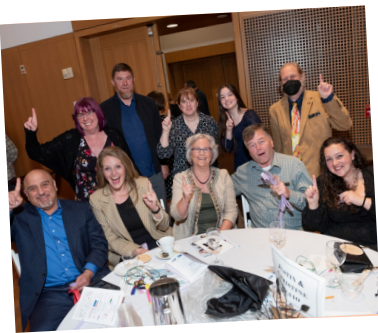
Quizine for a Cause