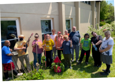
Earth Day @ Social Club!