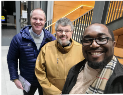
Wesleyan University Class Visit