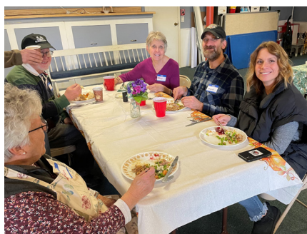
Thanksgiving Celebration at Essex First Congregational Church