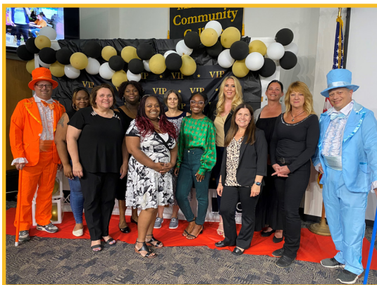
The annual Client Banquet returns!

experience mental health and addiction challenges, every day can bring experiences and choices that threaten to destabilize their lives and the people they care about. This is what makes the journey of hope and recovery so powerful and so meaningful. At the end of a year filled with reminders of our collective fragility, two men who have experienced the profound impact of recovery, ended the year at our Quizine event by sharing their stories of strength and resiliency which inspired the crowd and should inspire us all to continue to fight for this profound journey that we call Recovery!