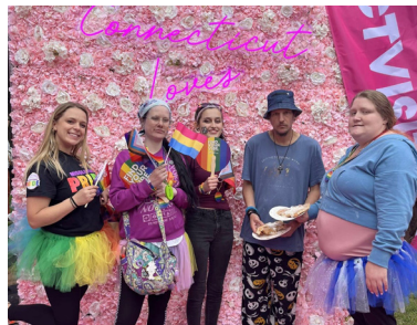
GAP attends the PRIDE parade in Middletown