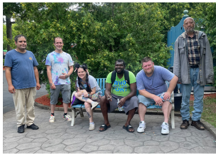
Fun at Lake Compounce!