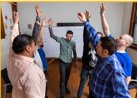
Farrell staff & clients had a blast at a day-long photo shoot for the revamped website.