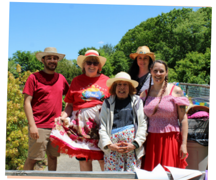
Brazilian Festa @ Gateway!