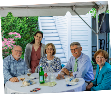
Gratitude Gathering Picnic