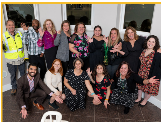
The committee & volunteers at Wesleyan University for the annual Quizine for a Cause!