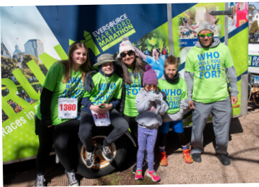
Run/Walk for Every 1!