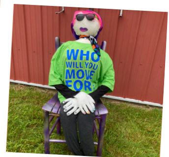
Look who we found at the Chester Fair!