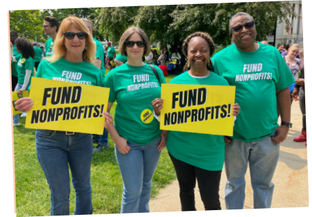
Nonprofit Rally Day