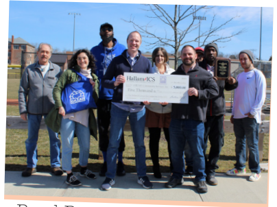
Road Race Training & a "Big Check" from Hallam ICS!