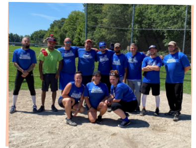
Farrell Sober Softball League