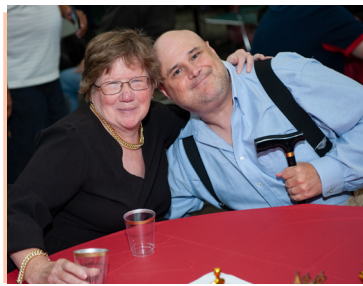
Red Carpet Themed Annual Client Banquet