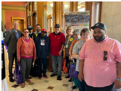
Testifying at the State Capitol