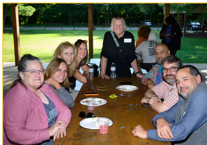
Staff Appreciation Picnic at Camp Ingersoll