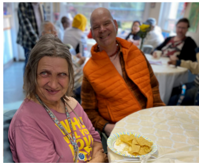
Lunch at the Social Club