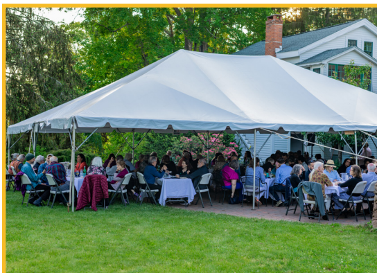
Celebrating our donors & volunteers at Gilead's Gratitude Gathering