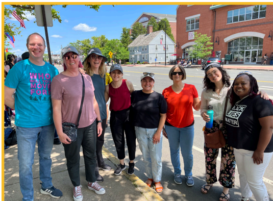
Staff attend Middletown's first ever Juneteenth Parade