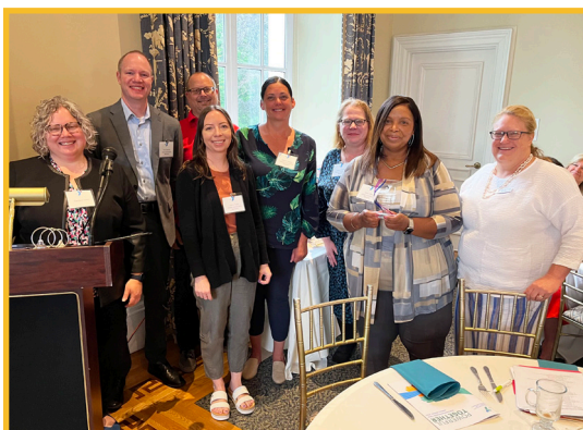
Northern Middlesex YMCA Community Champion Award